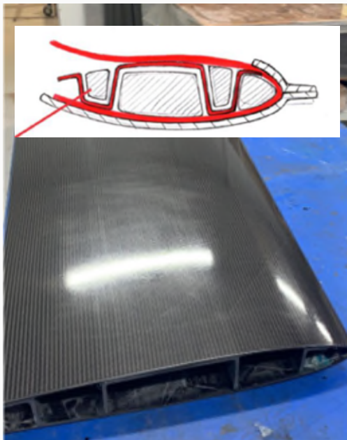
High CFRP integration